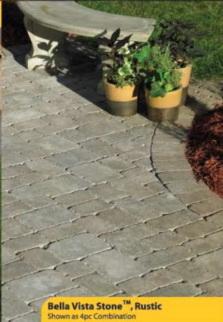
Bella Vista Stone™, Rustic Shown as 4pc Combination