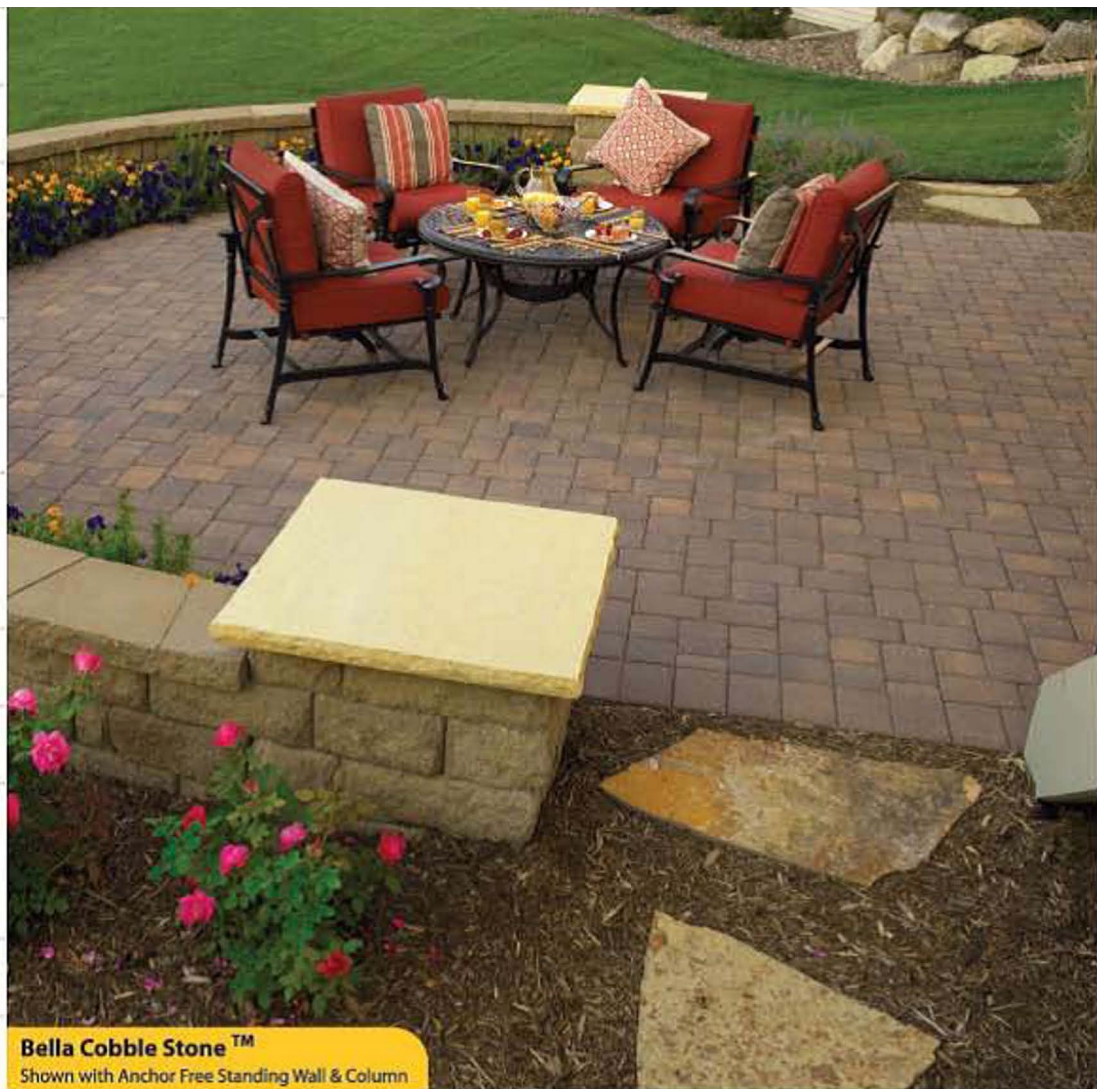
Bella Cobble Stone™ Shown with Anchor Free Standing Wall & Column

Bella Stone Interlocking Pavers offer a variety of sizes, colors, and textures to choose from. When combined with the durability of concrete and lifetime Bella Stone Guarantee, the choice is easy, Bella Stone Interlocking Pavers. "Beyond Beautiful"™